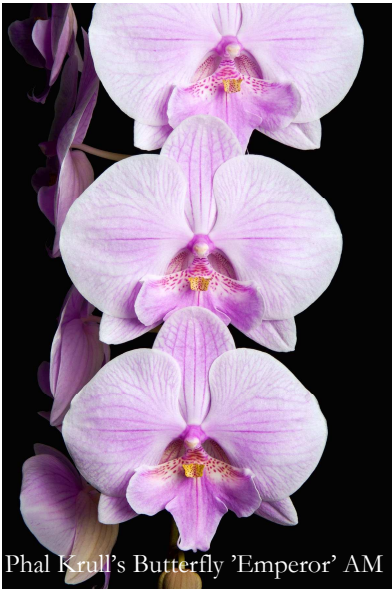
Phal Krull's Butterfly 'Emperor' AM