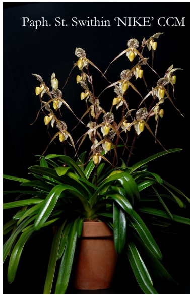
Paph. St. Swithin 'NIKE' CCM