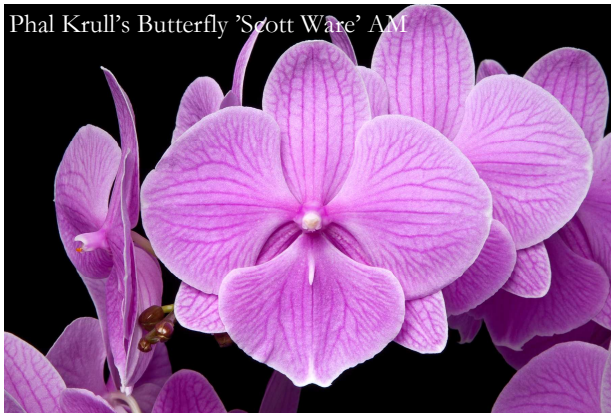
Phal Krull's Butterfly 'Scott Ware' AM