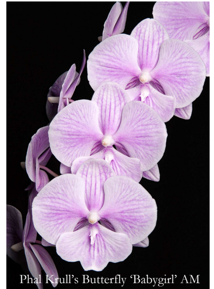
Phal Krull's Butterfly 'Babygirl' AM