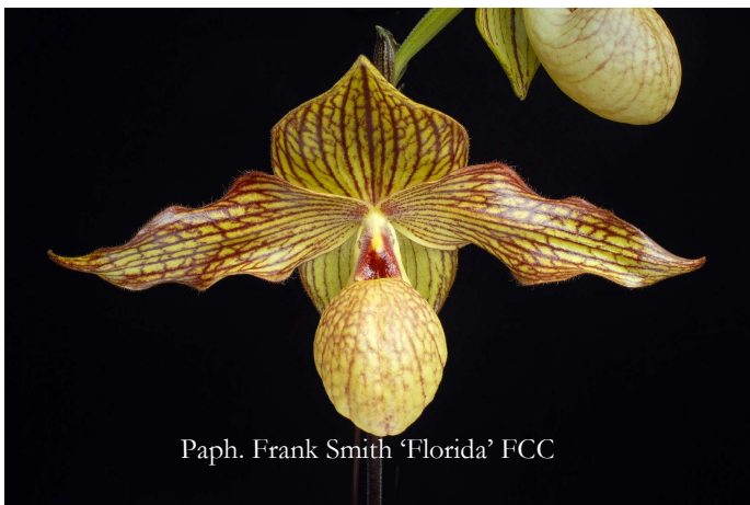
Paph. Frank Smith 'Florida' FCC