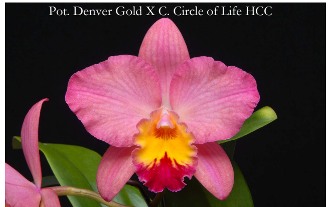
Pot. Denver Gold X C. Circle of Life HCC