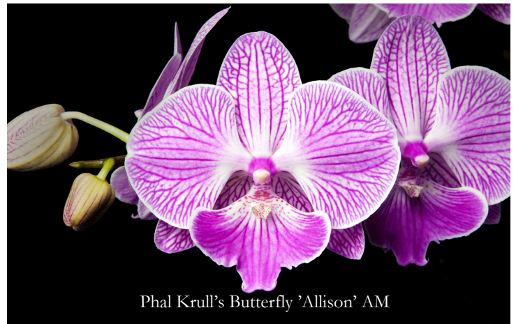
Phal Krull's Butterfly 'Allison' AM