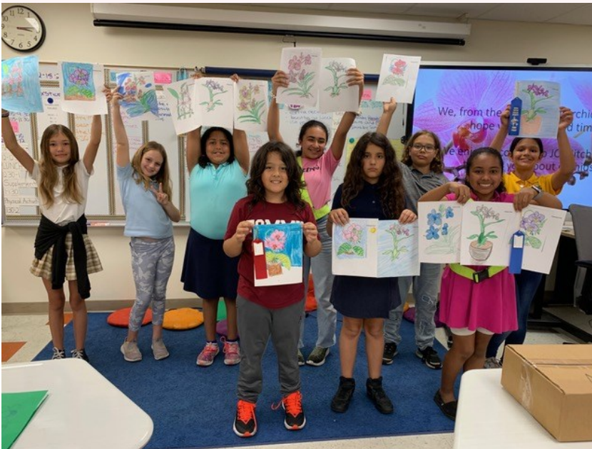
After School Orchid Program Students and Their Artwork