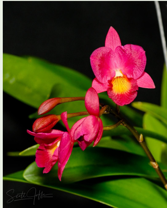
Guaricattonia Jairak Jewel/Red - Sally Glick