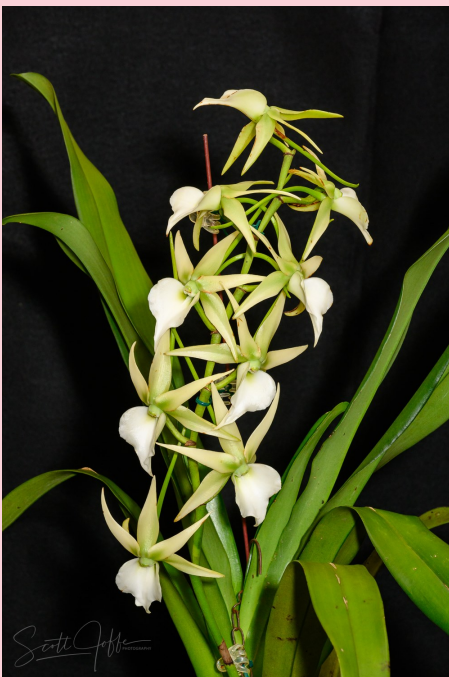
Angraecum sesquipedale—Denise Guzman