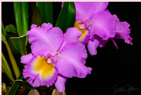
Bc Hawaiiiai Agenda—Sally Glick

BEST IN SHOW: Congratulations to Sally Glick!