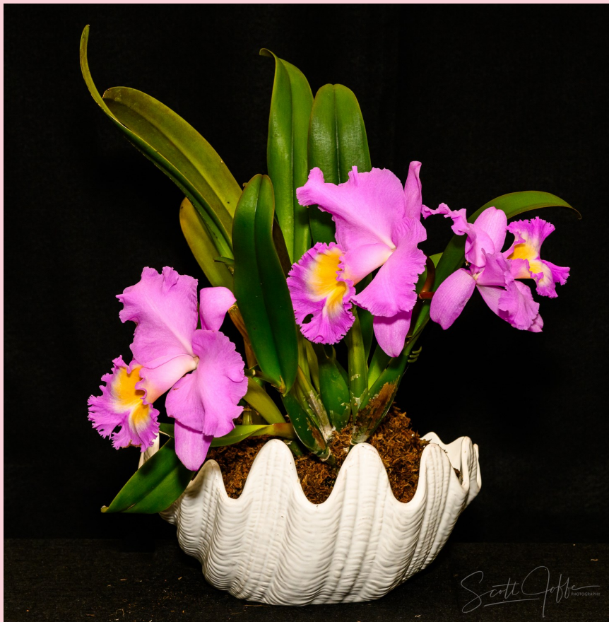
Bc.Hawaiiia Agenda—Sally Glick