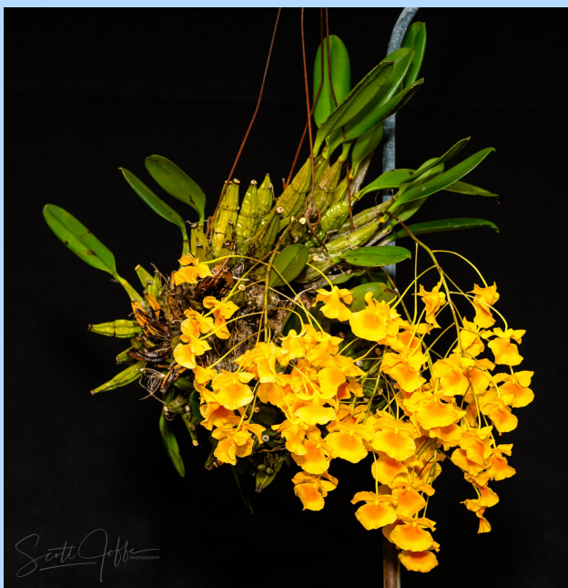
Den. aggregatum —Belinda Krause