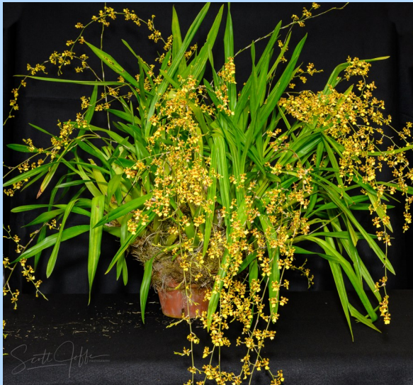
Oncidium sphacelatum