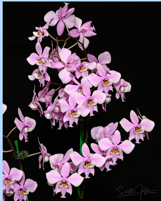
Phal. Schilleriana