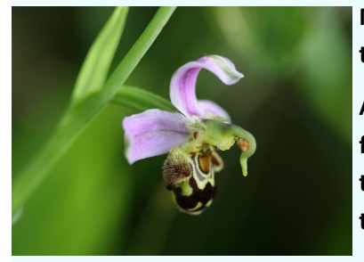
Bumble Bee Orchid

Rich discussed some of the strategies that orchids use to attract pollinators by deception. The Bee Orchid (Ophyrus apifera) is a Florida orchid characterized by markings that give the illusion of a female bumble bee perched on the flower. Eager male bees swarm to these flowers, and in the act of what they think is procreation (which it isn't,) they spread pollen from flower to flower.