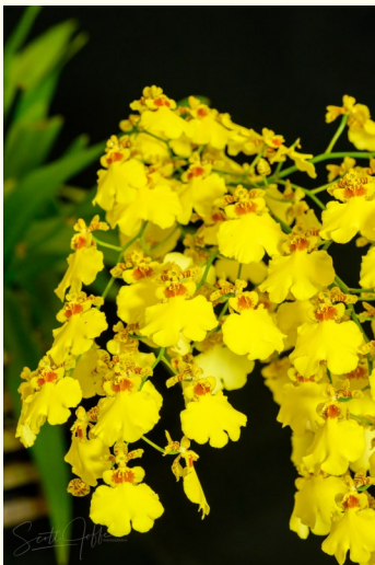
Onc. Flevorum Yellow—Denise Guzman