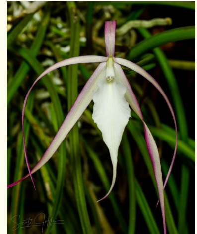
Brassavola Yaki Blacks Best—Roderick Lewis