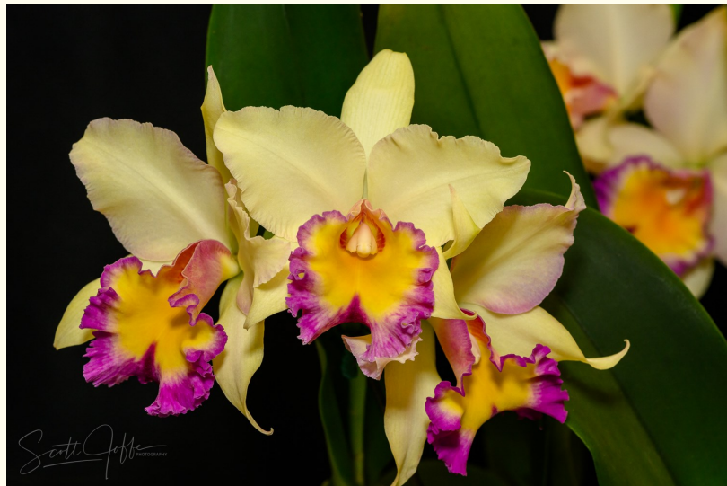
BLC (Love Sound x Horizon Flight) Svo Picotee x P. Angel's Flare FCC/AOS Robert Finocchi ***Best Blue Ribbon***