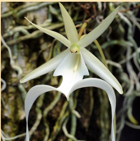
The flower of the Ghost Orchid ( Dendrophylax lindenii )

However, according to the experts, the greatest challenge to the ghost orchid's survival is poaching. For this reason, the exact locations of the orchids in many of the swamps on the southwestern edge of the Everglades are kept secret.