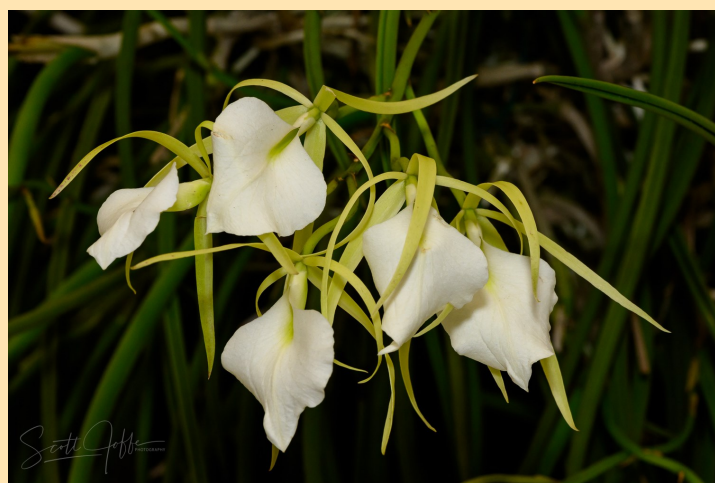
Brassavola nodosa—Roderick Lewis