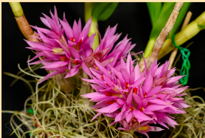
Dendrobium bracteosum—Denise Guzman