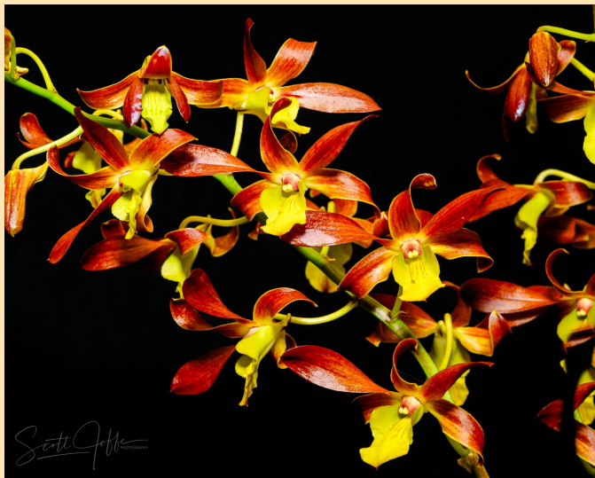
Dendrobium Rambo—Teresa O'Neil *** Best Blue Ribbon ***