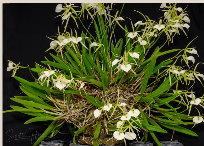
Brassavola nodosa—Rod Lewis