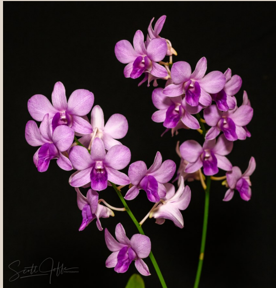
Dendrobium Blue Planet—Teresa O'Neil