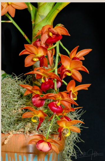
Cyod Taiwan Gold Orange—Denise Guzman