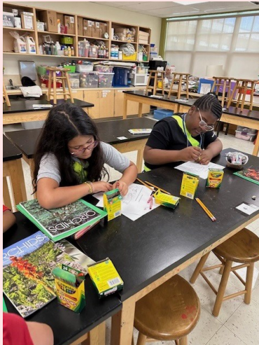
Students coloring orchid drawings

If you would like to volunteer, your help would be greatly appreciated. Contact BJ Saul, bjfsaul@comcast.net , 561-347-0618