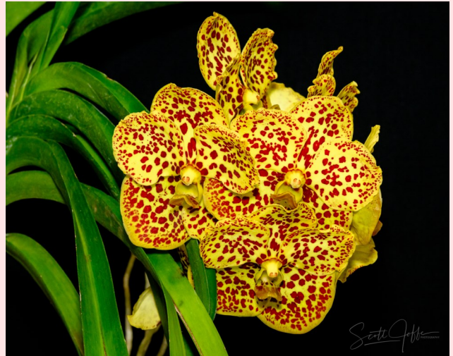
V. Prapathom Gold x Chaopraya—Beth Bowe