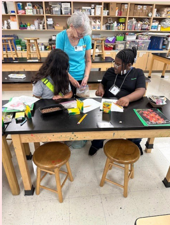
Exploring orchid growing medium