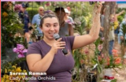
Serena Roman Lady Vanda Orchids

Time: 10:00 a.m. – 5:00 p.m. FREE with paid museum admission