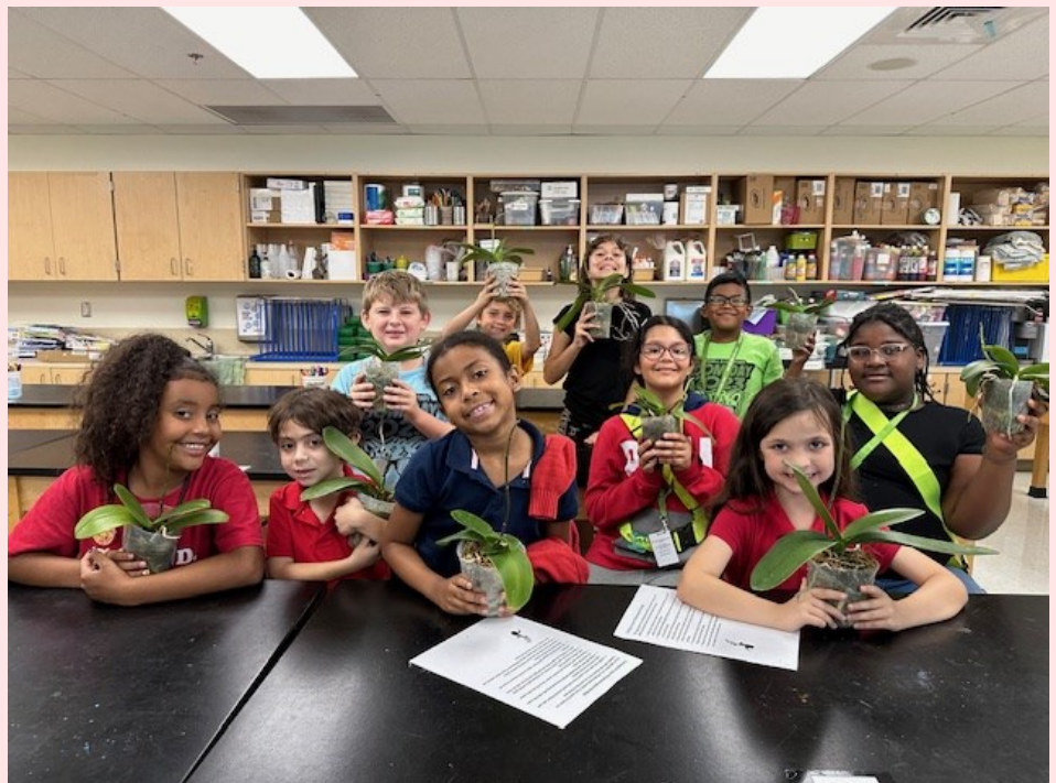
JC Mitchell students proudly displaying their Phalaenopsis plants