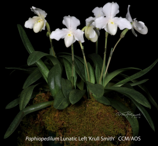
Paphiopedilum Lunatic Left 'Krull Smith' CCM/AOS