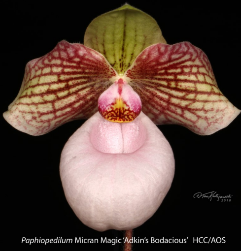
Paphiopedilum Micran Magic 'Adkin's Bodacious' HCC/AOS