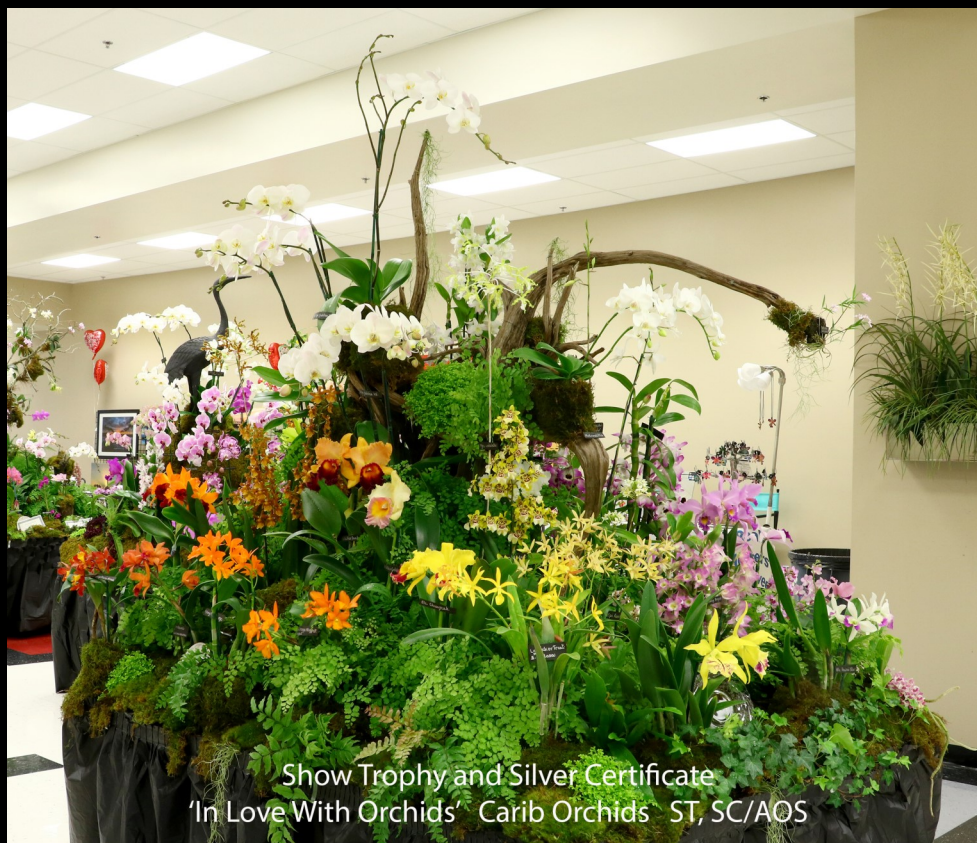
Show Trophy and Silver Certificate 'In Love With Orchids' Carib Orchids ST, SC/AOS