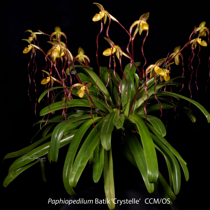
Paphiopedilum Batik 'Crystelle' CCM/OS