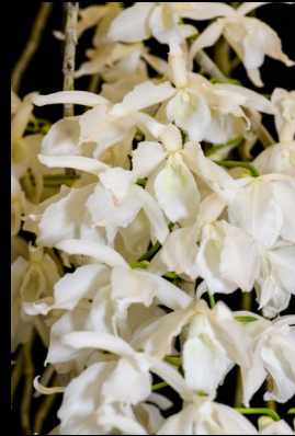
Den anosmum alba