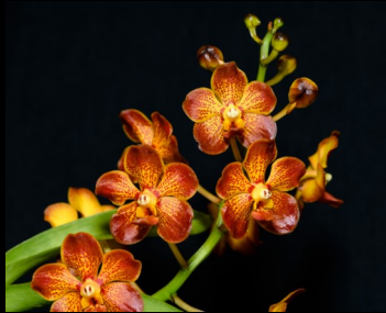
Vanda Blood Orange