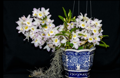
V. tessellate 'Mary Motes' FCC/AOS