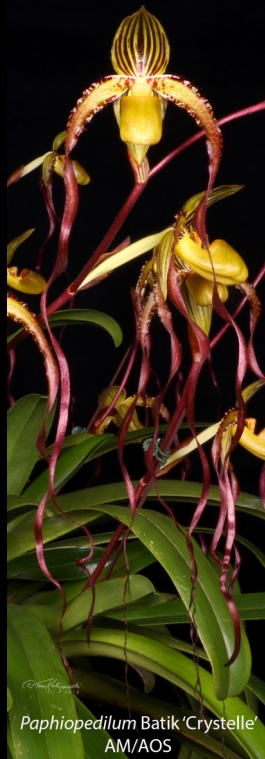
Paphiopedilum Batik 'Crystelle' AM/AOS