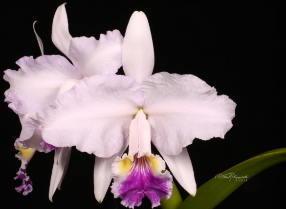
Cattelyaluedd lueddemanniana f. coerulea 'Jean Gillirand' FCC/AOS