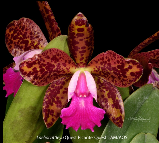
Laeliocattleya Quest Picante 'Quest' AM/AOS