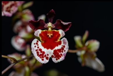
RRM Radiant Charm X Tolumnia Elfin Star