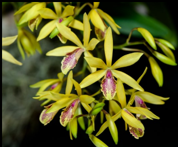
Epc. Kyoguchi "Fumi"