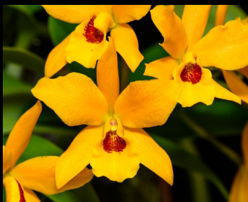
LC Gold Digger "Orglades Mandarin"