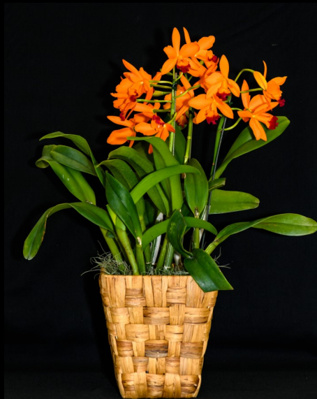
Pot Love Passion "Island Romance"