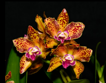
BLC Wainae Leopard "Ching Hua"