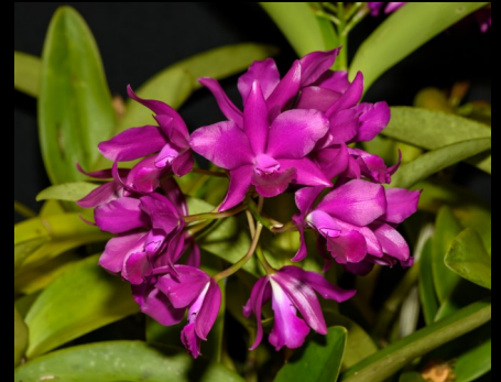
Epidendrum Charlie Brown