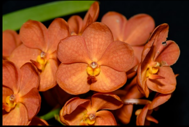
Asco. Yip Sum Wah