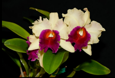
BLC Goldenzell Peach Parfait X Toshie Moki Richie