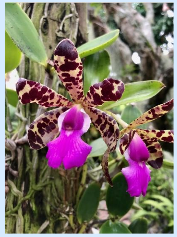
Cattleya aclandiae