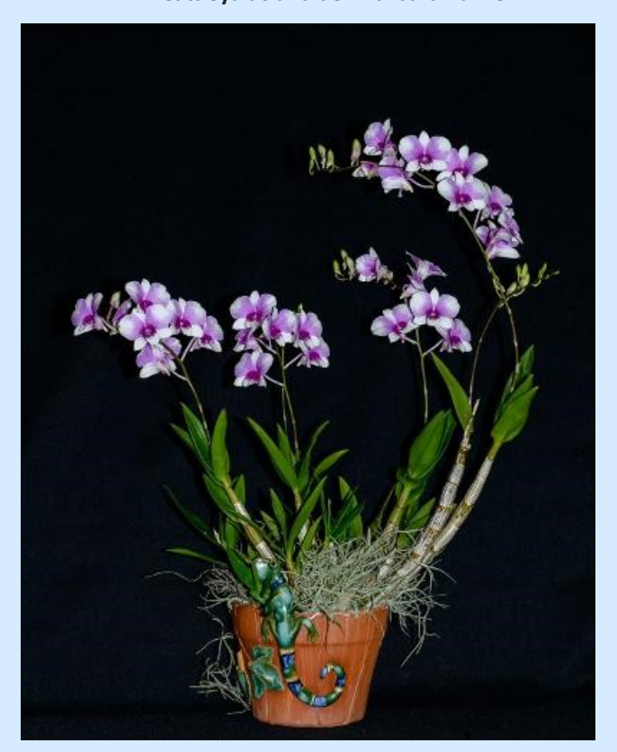
Den Burana Doll 7 - Belinda Krause