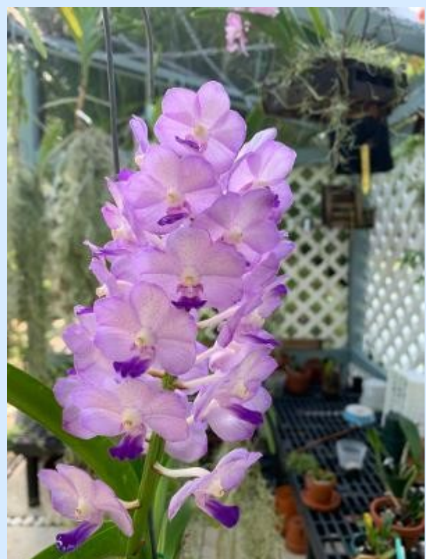
Vandacho Blue Gem - Teresa O'Neil