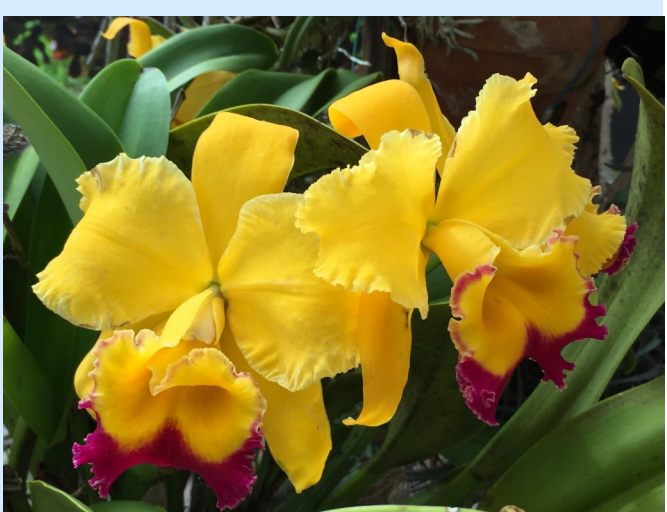
BLC Chyong Guu Chaffinch Ta Hsin - Cheryl Dodes