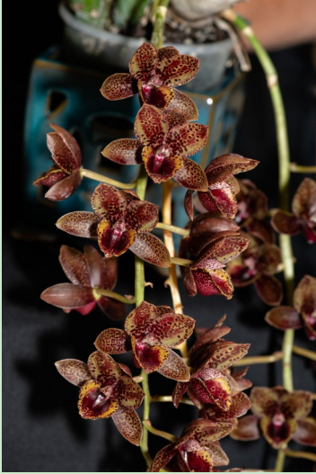
FDK After Dark 'Sunset Valley Orchids'