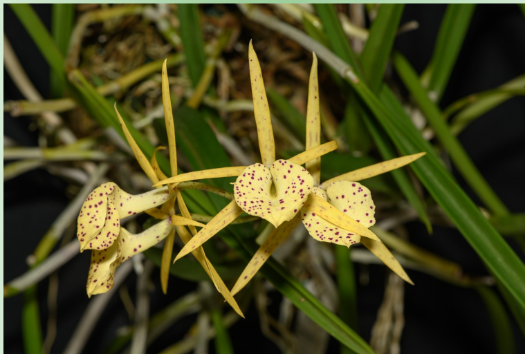
Brassavola Yellow Bird (Best in Show)