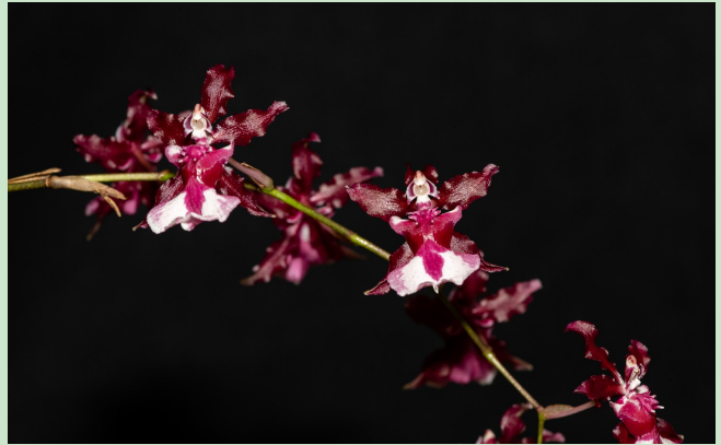
Onc. Heaven Scent