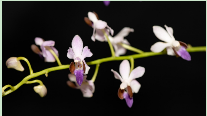
Phal. Peter K Blue Lip