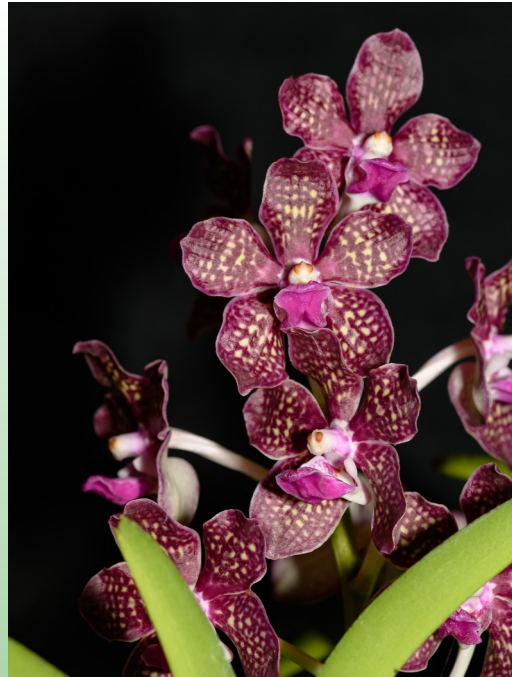
Vanchostylis Ocean Storm X Mimi Palmer