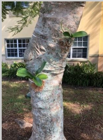
Two Phalaenopsis attached to a large tree