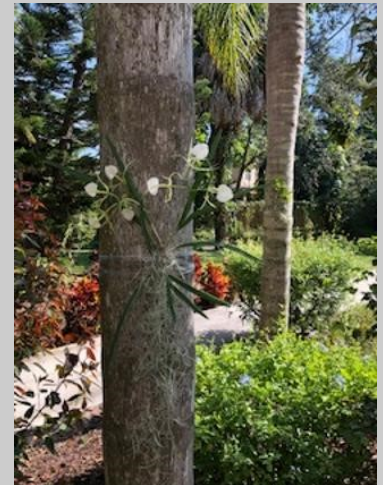
A Mokara Vanda on top, Nodosa "little Stars" and a "noID" Schomburkia at the bottom