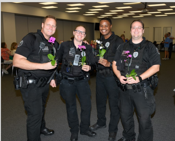
Each officer picked an orchid to take home