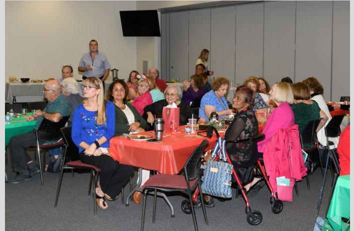
BROS members had a good time at the meeting