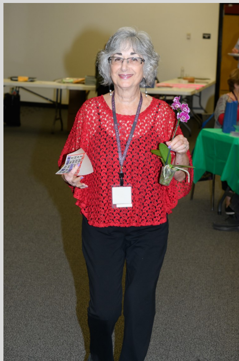
Our Bingo Winners!