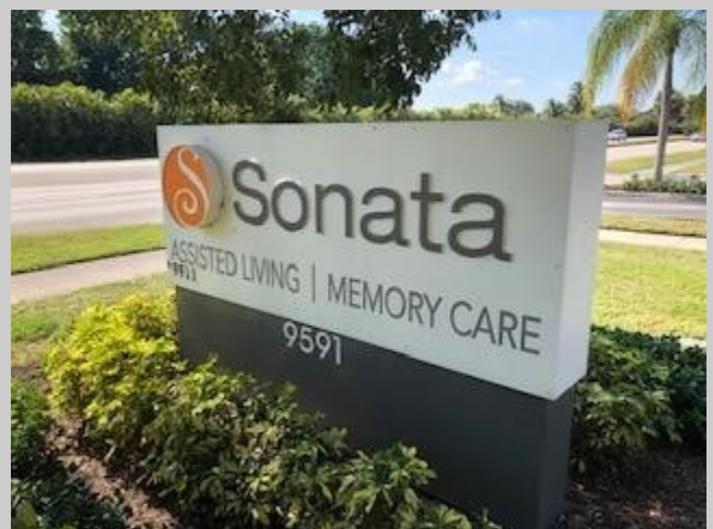
The facility where we placed the orchids