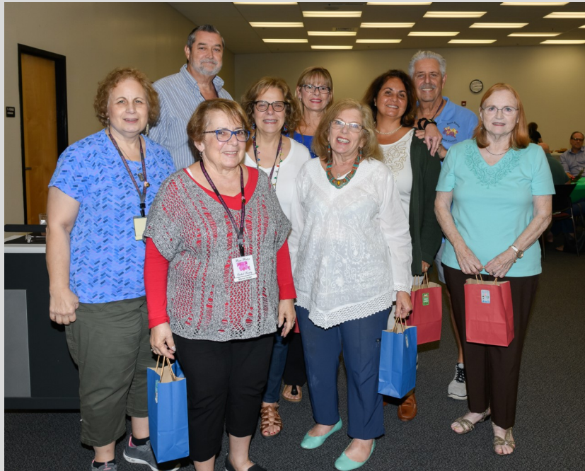
The 2019 BROS Board of Directors

After meeting business was conducted, attendees enjoyed a delicious buffet of sandwiches and desserts, and three rounds of Orchid Bingo. Boca Raton police officers joined in the fun, calling the Bingo games. Winners of each game chose from among many beautiful orchid plants for their prizes. The officers gratefully accepted all the toys generously donated by BROS members for distribution to local children who might otherwise not receive any gifts.