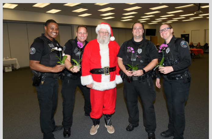
Thanks to our Boca Officers and Santa!