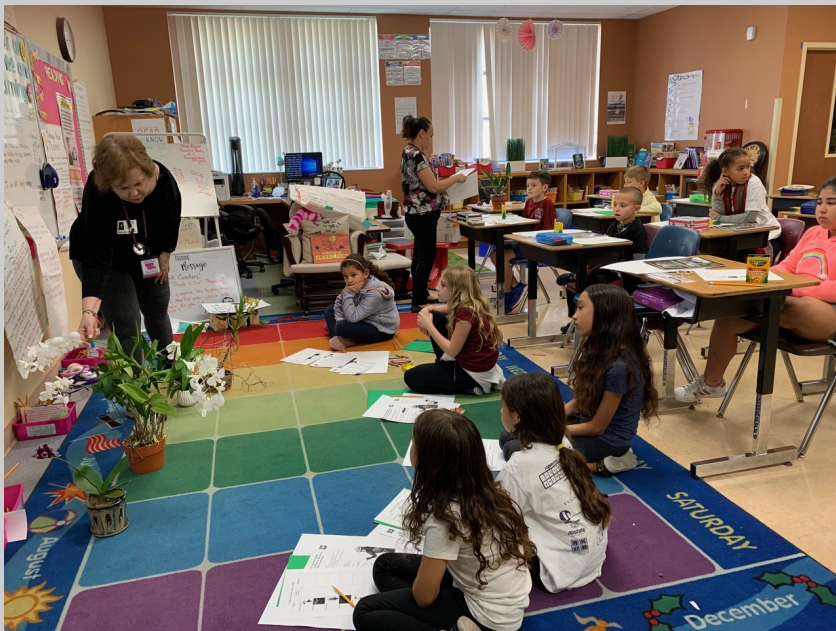
Elementary School Students Enjoying BROS After School Orchid Program Activities

If you would like to volunteer, your help would be greatly appreciated. Contact BJ Saul, bjfsaul@comcast.net , 561-347-0618