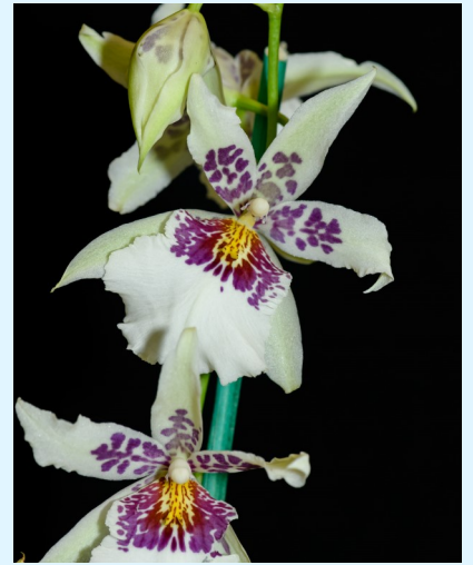
Beallara Tohama Glacier