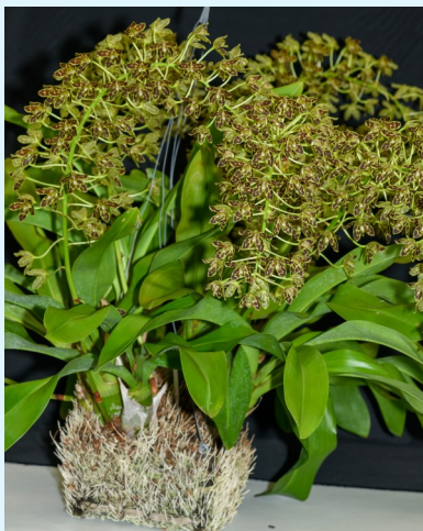
Gram. Scriptum Grasshopper