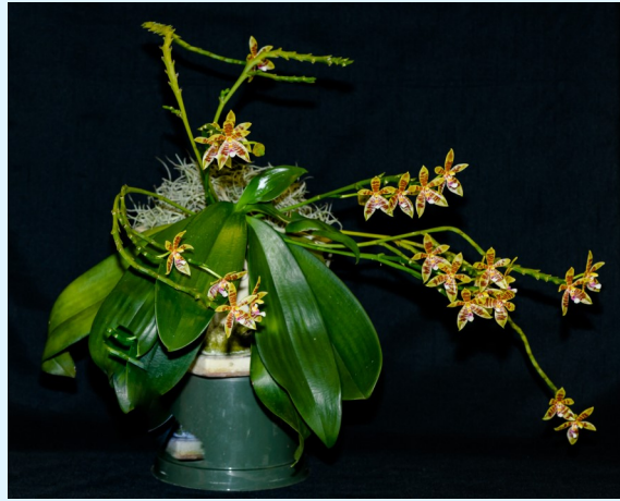
Phal. Tetrapsis 'Classic Moonbeam' X Phal. Cornu-cervi v. chattalade 'Orchid Class Ruby'