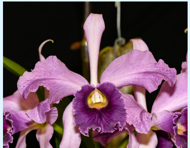
Cattleya Azure Sky