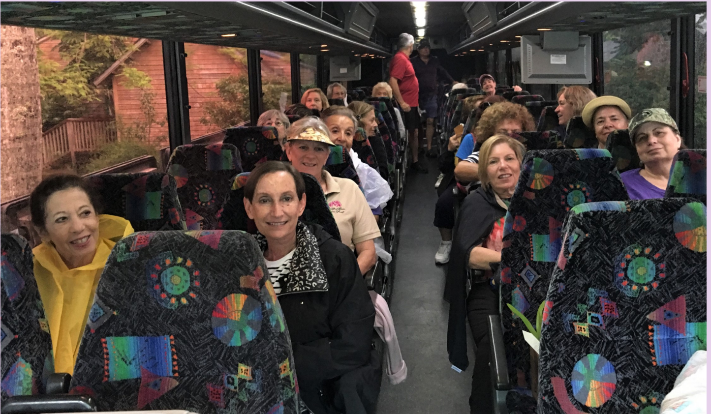
BROS arrives at the Redlands Orchid Festival, May 19, 2018