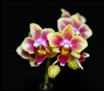
Phalaenopsis Sogo Gotris

B. perrinii 'Ruben' X C. Chocolate Drop 'SVO' AM/AOS