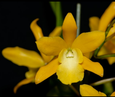
LC Golddigger X Enc. Rufa