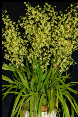
Encyclia Rufly Profuse