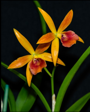
BC Estrella del Aconquija

B. perrinii 'Ruben' X C. Chocolate Drop 'SVO' AM/AOS