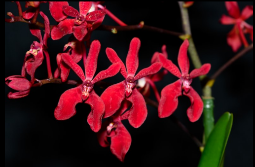
Renanstylis Azimah X Renanthera Bangkok Flame