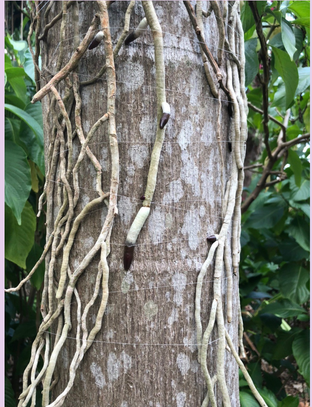
Ghost Orchid Firmly Attached to Tree