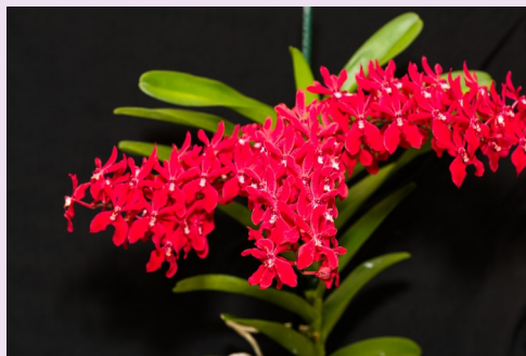
Renanstylis Azimah X Renanthera