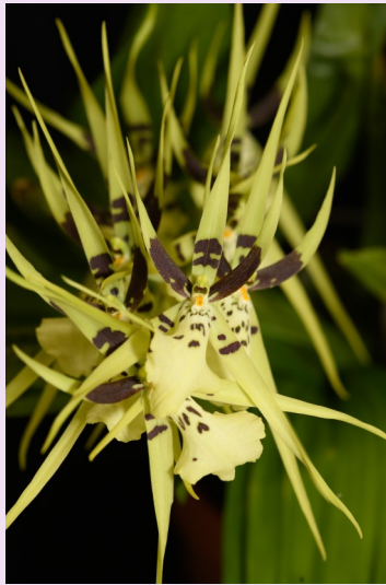
Brassia rex 'Lea'