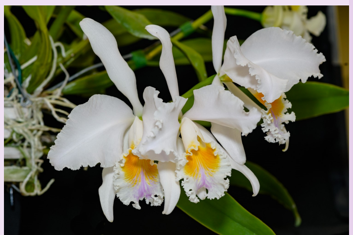
C. Mossiae 'Rochelle'