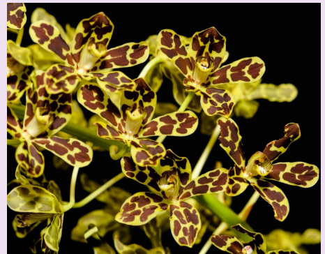
Gram. Scriptum Leopard