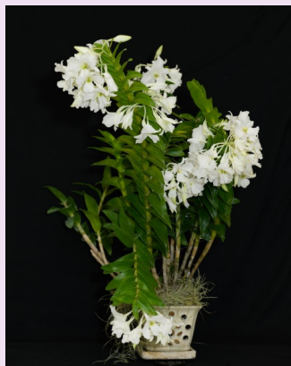
Den. Isabel Seander