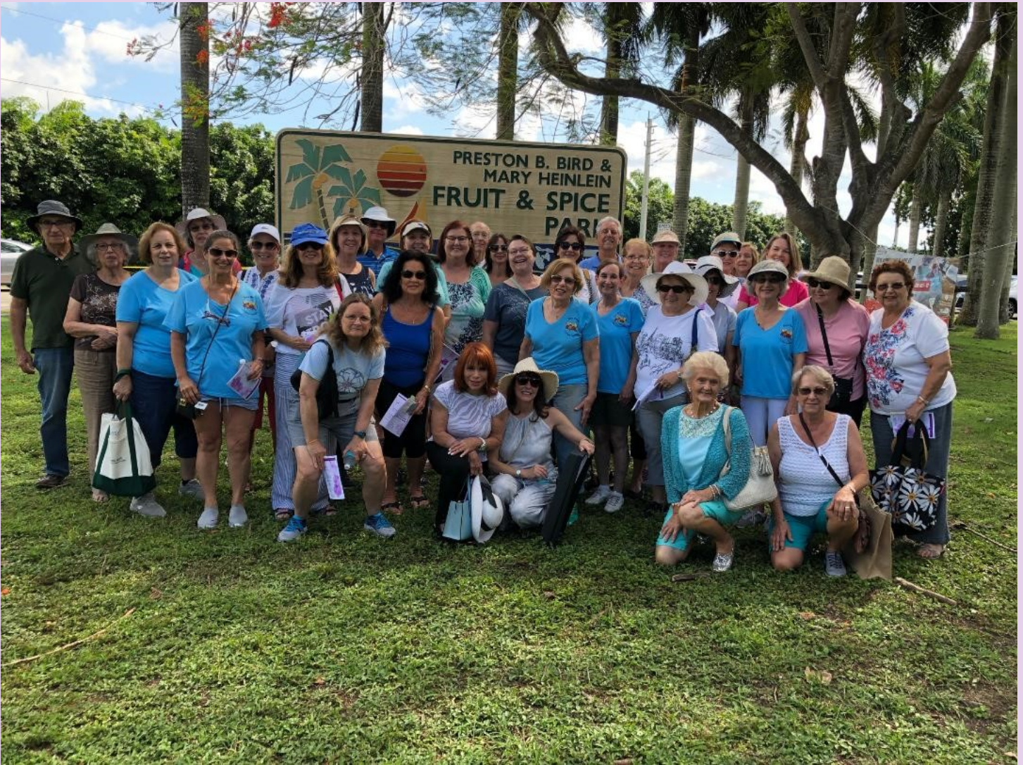
BROS and Friends at the Redlands Orchid Festival, May 18, 2019