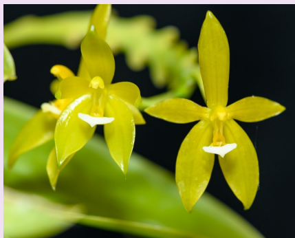
Phal. cornu-cervi Flava