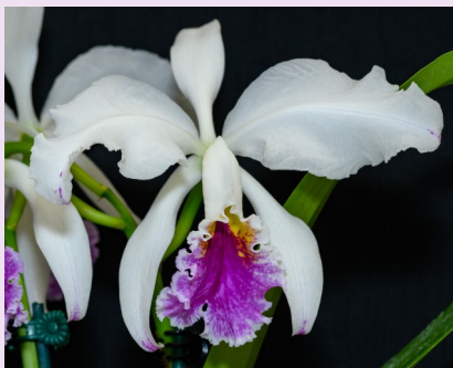
C. mossiae "Llamarada"