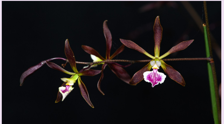
Enc. Jungle Nights