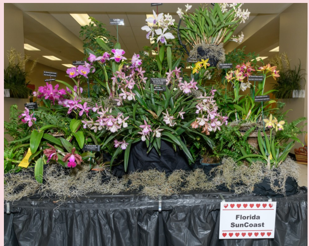
Florida Suncoast Orchids