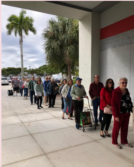
Eager Show-Goers Lined Up Saturday Morning