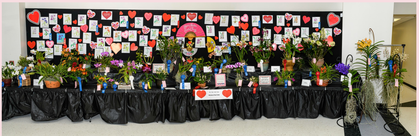
Members' Plants and Children's Artwork