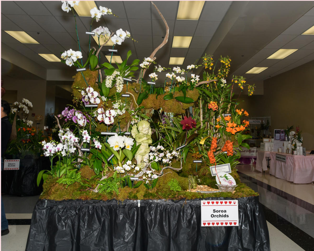
Soroa Orchids - AOS Show Trophy and Silver Certificate Winner