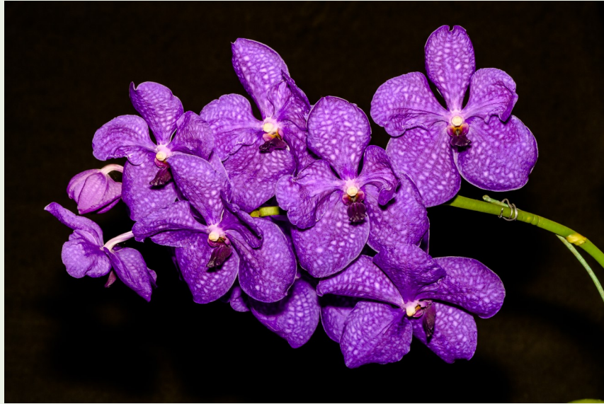
Vanda Pachara Delight