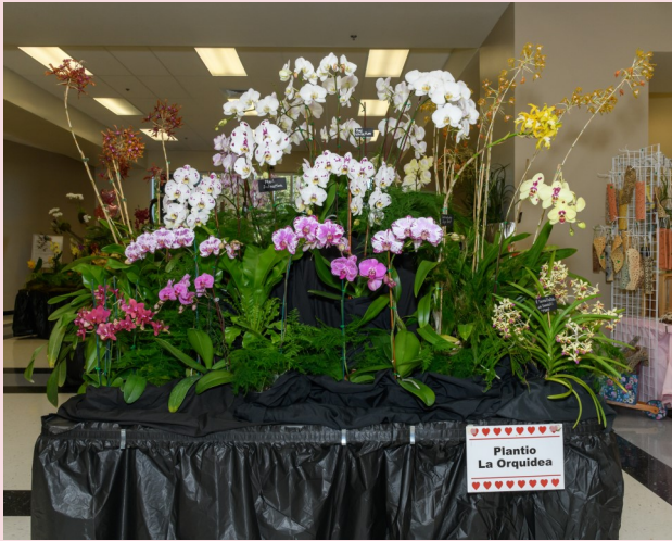
Plantio La Orquidea