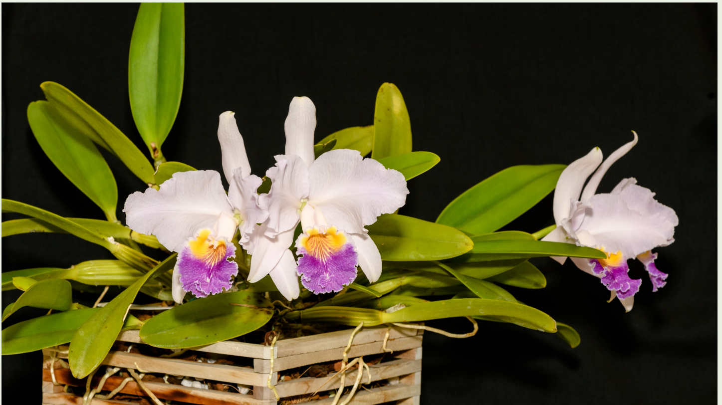
C. lueddemanniana coerulea