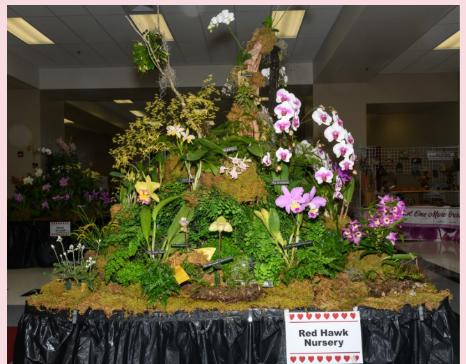
Red Hawk Nursery