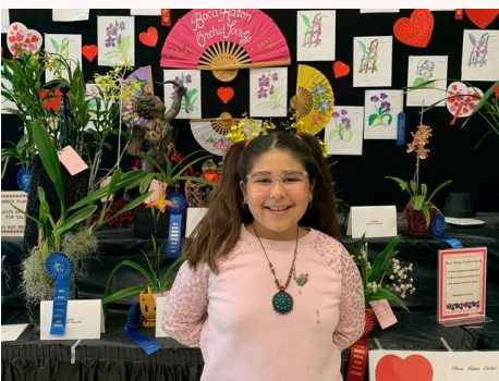
Look who was spotted at the BROS Orchid Show!