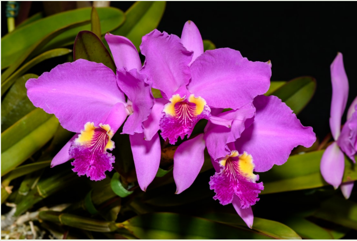
C. lueddemanniana Mariauxi x Yamile