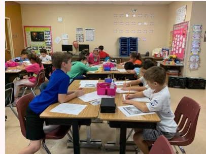
Art Work in Progress