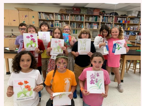
Proud of Our Art Work!