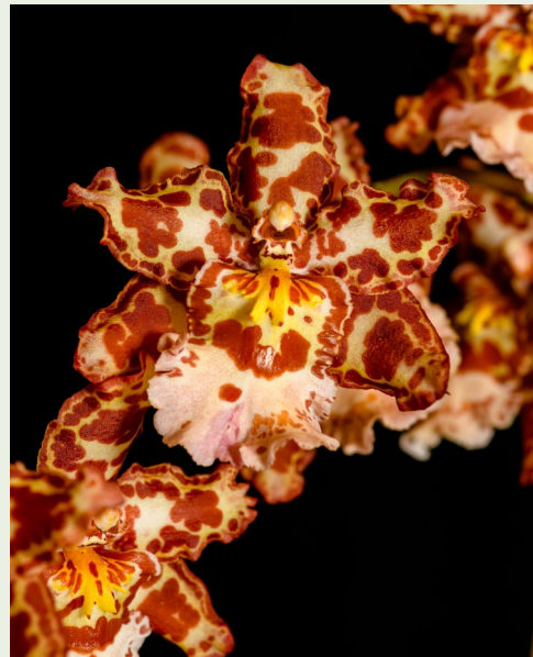
Wils. Eye Candy 'Penny Candy'