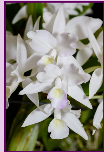
C. skinnerii Alba