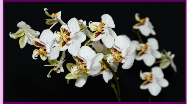
Phal. stuartiana "Sogo"