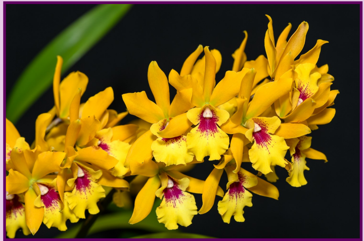
Epilaeliocattleya Jackie Bright 'Hilo Stars'