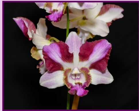
Den. Dragon Eye