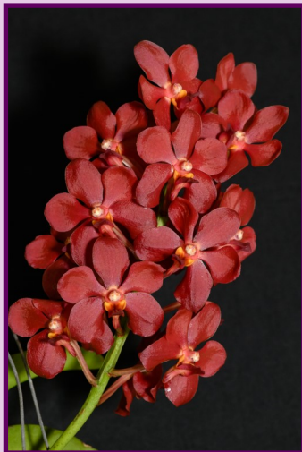
Ascda. Sweet Pea "Ruby"