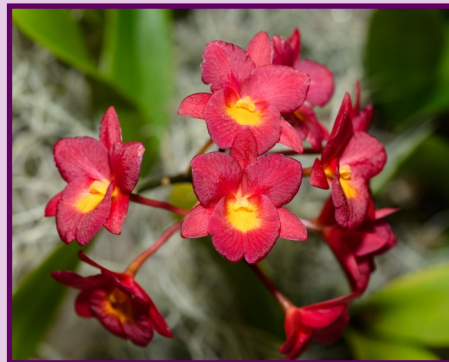
Ctna. Why Not