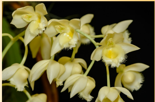
Cl. Rebecca Northen 'Grapefruit Pink'