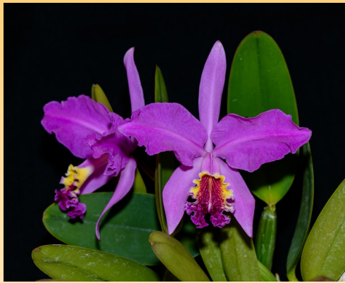
Cattleya lueddemanniana 'Draco' X 'Inferno'