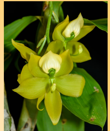
Cyc. warszewiczii X Cyc. Richard Brandon