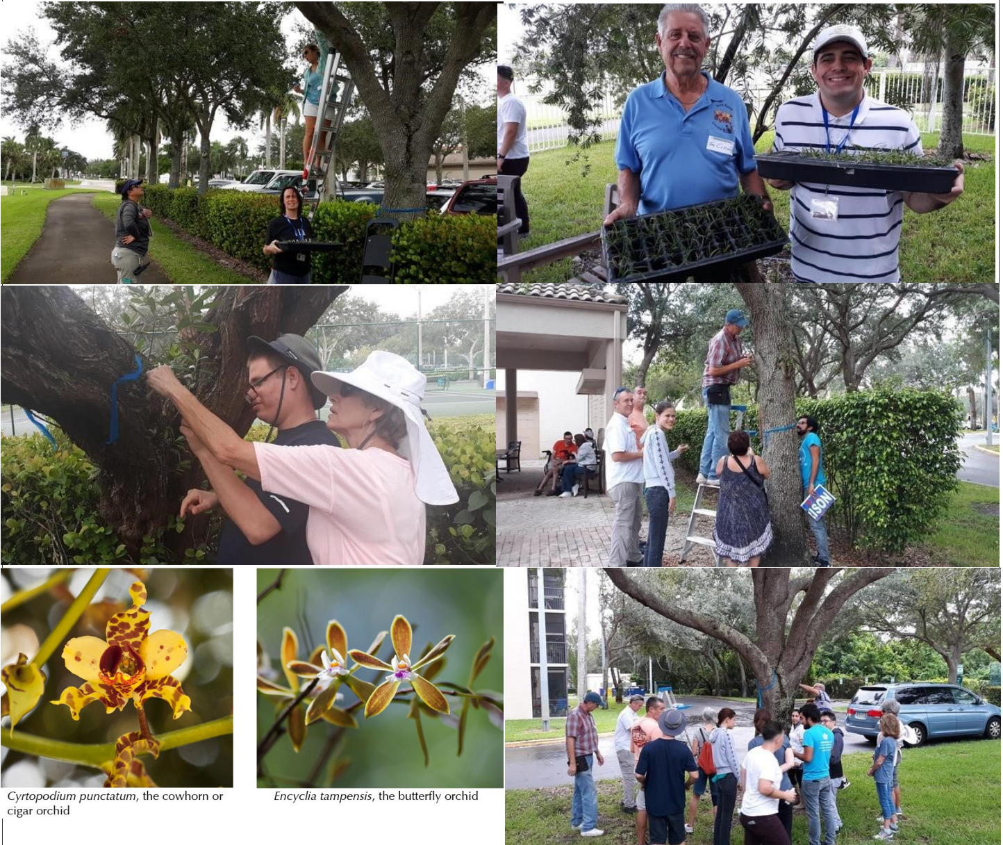
Cyrtopodium punctatum , the cowhorn or cigar orchid

At the end of September, BROS members participated in placing native orchids in the trees at the Levis JCC in Boca Raton. The orchids were propagated as part of the Million Orchid Project, which is seeking to repopulate South Florida with orchids native to the area. The orchids were tied to trees high enough so that they will not be disturbed. The Million Orchid Project raises the orchids in flasks, and when the orchids are mature enough, places them back into the environment. Below are photos of BROS members, along with JCC staff and members placing orchids in the trees on the JCC campus.