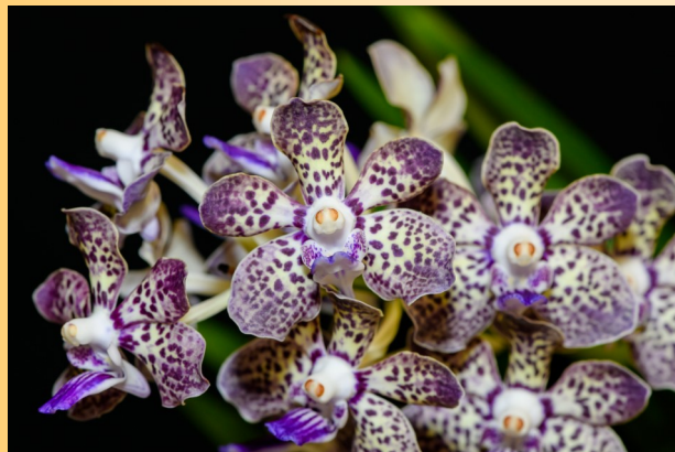
T. lamellate X brunea X Mimi Palmer