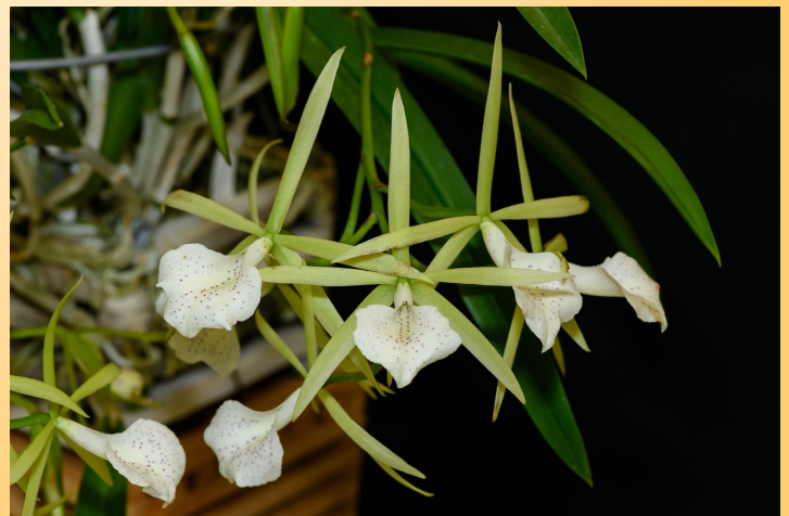
Bc. Binosa 4N