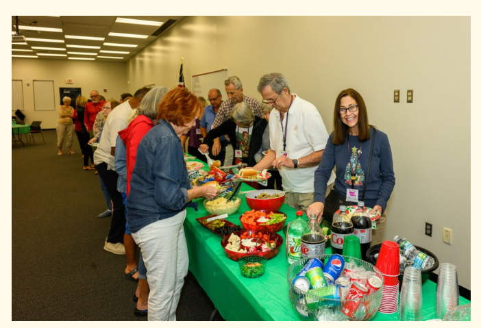
The food was plentiful and delicious!