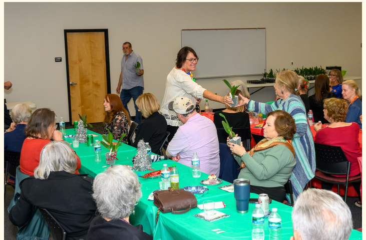
All members went home with at least one orchid plant