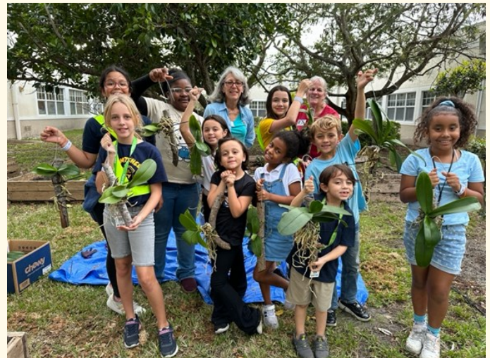
The Next Generation of Orchid Lovers of Boca Raton, Florida!