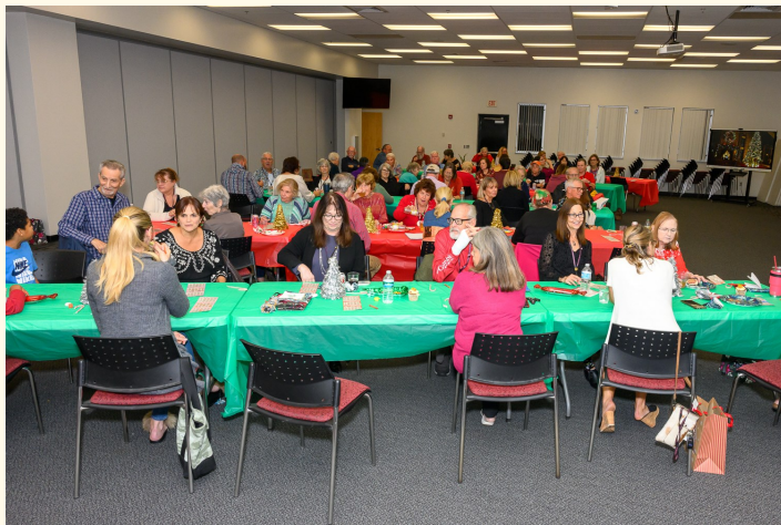
We enjoyed our delicious sub sandwiches, sides, and desserts