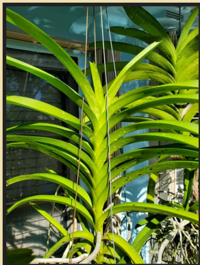
Strap Leaf Vanda

Please note: The recommendations from other sources may be different from those above. This is what is working for my orchids.