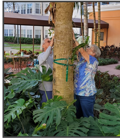
Orchid mounting at Stratford Court in progress