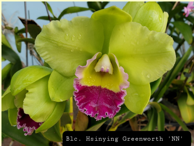
Blc. Hsinying Greenworth 'NN'