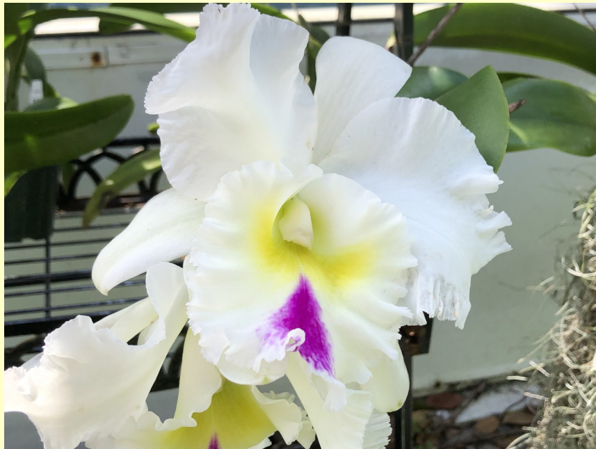
Rlc Orglades Grand x Rlc Mount Hood- Cheryl Dodes