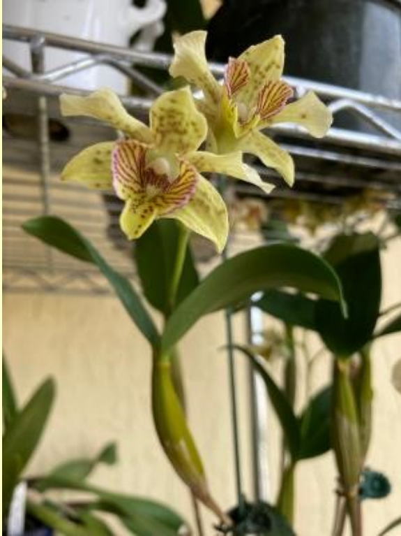
No ID - Janice Larit