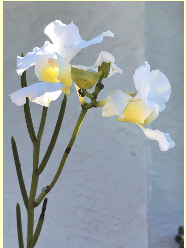
Papilionanthe Poepoe var alba 'Diana' AM/AOS - Joyce Patterson