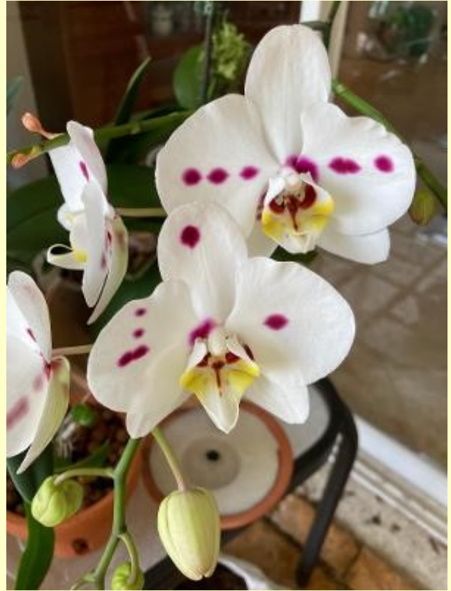
No ID Phal - Janice Larit