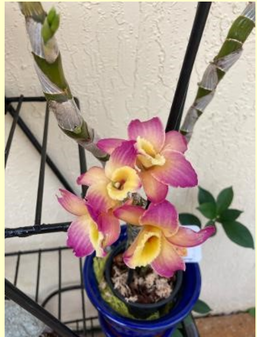
No ID Dendrobium - Janice Larit