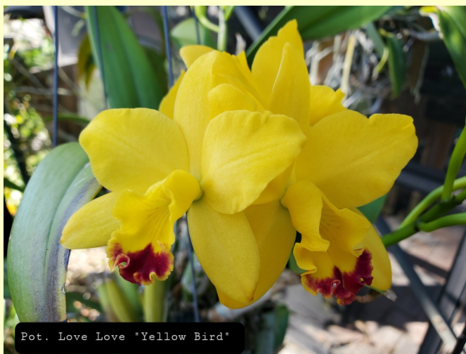
Pot. Love Love "Yellow Bird"