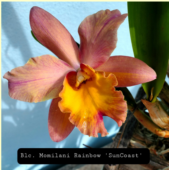
Blc. Momilani Rainbow 'SunCoast'