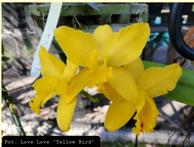
Pot. Love Love "Yellow Bird"