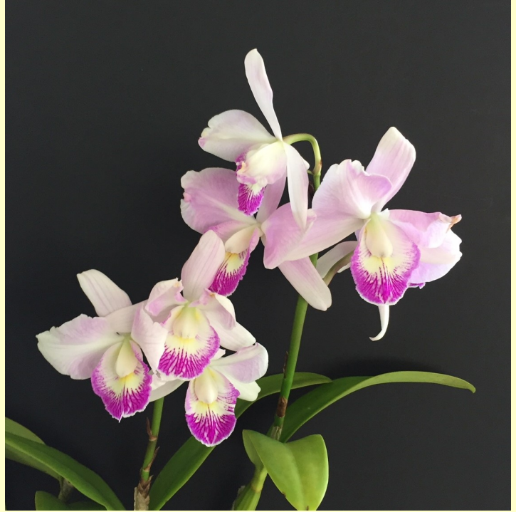
Clty. Spring Fragrance 'Paradise' - Belinda Krause