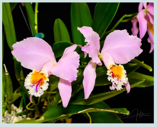
C. mossiae 'Veronica' x 'Julietta Bosque' - Roberto Finocchi