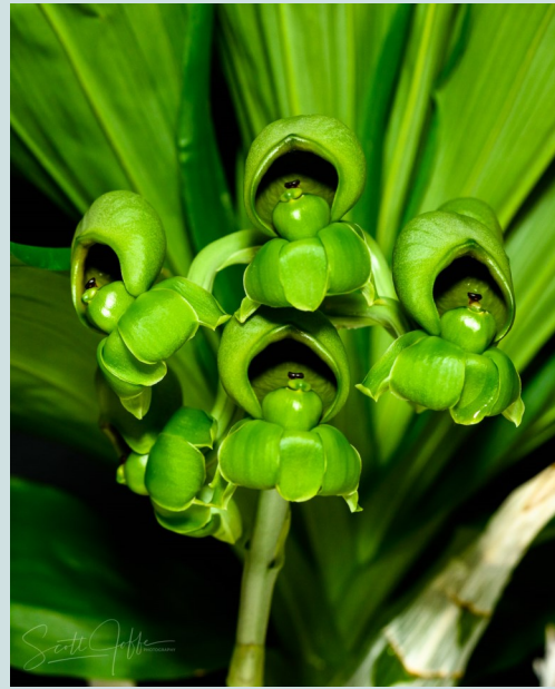
Catasetum macroglossum—Robert Finocchi