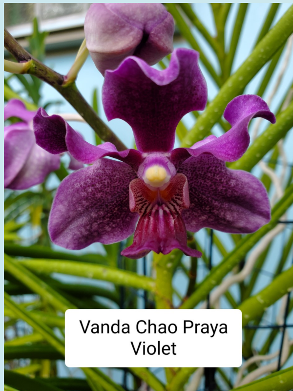
Vanda Chao Praya Violet