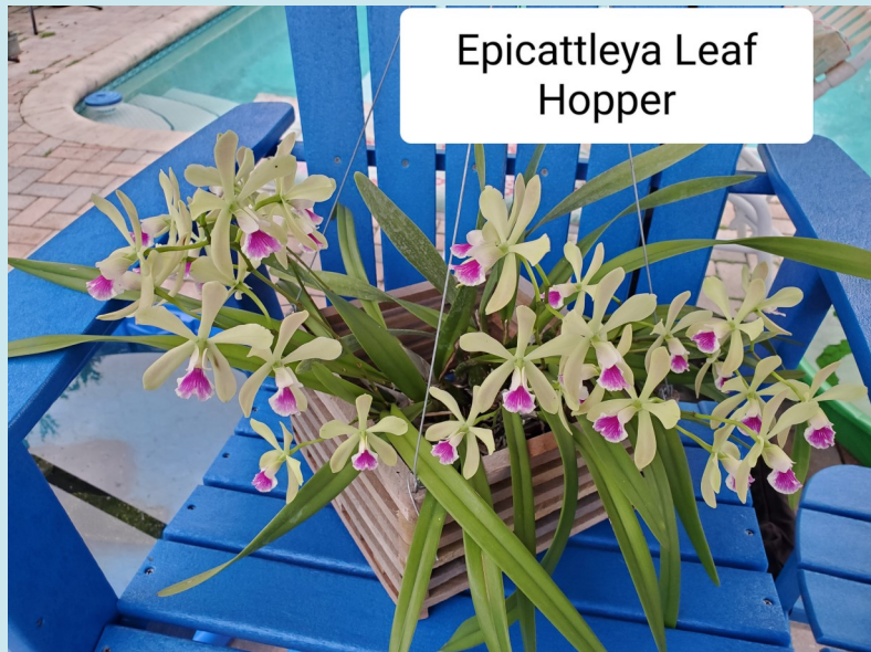
Epicattleya Leaf Hopper