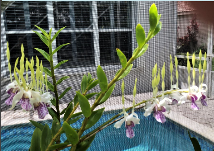
Dendrobium samurai - Cheryl Dodes