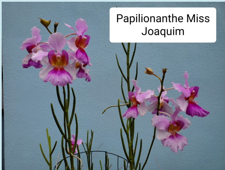
Papilionanthe Miss Joaquim