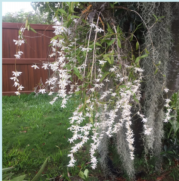
Dendrobium crumenatum - The "Thunderstorm Orchid" - Belinda Krause