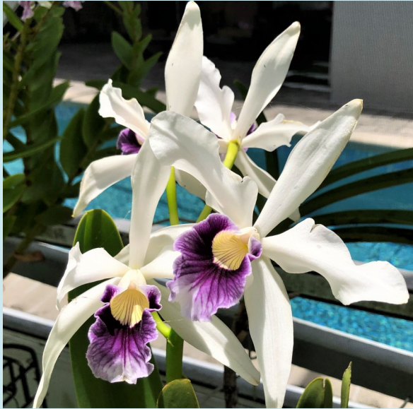
Laelia purpurata - Cheryl Dodes