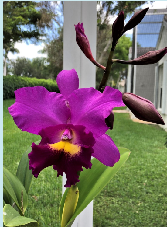
Potinara Hsin Ying 'Pink Doll' - Cheryl Dodes