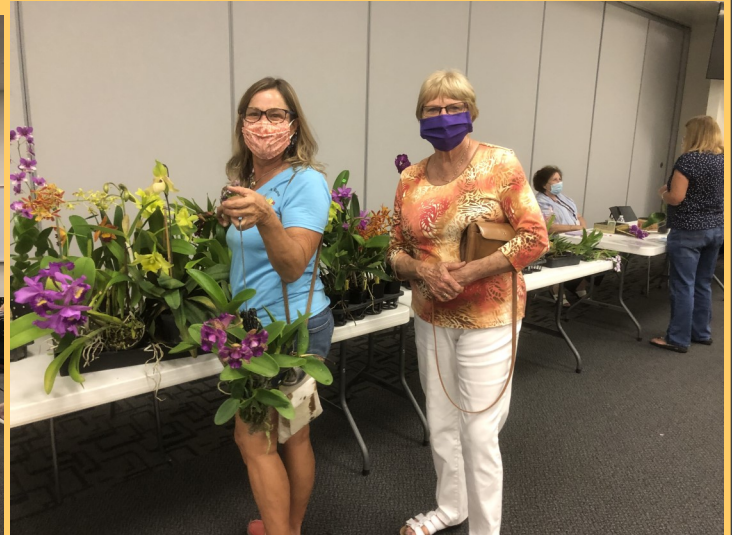
Members buying plants and demonstrating COVID safety protocols