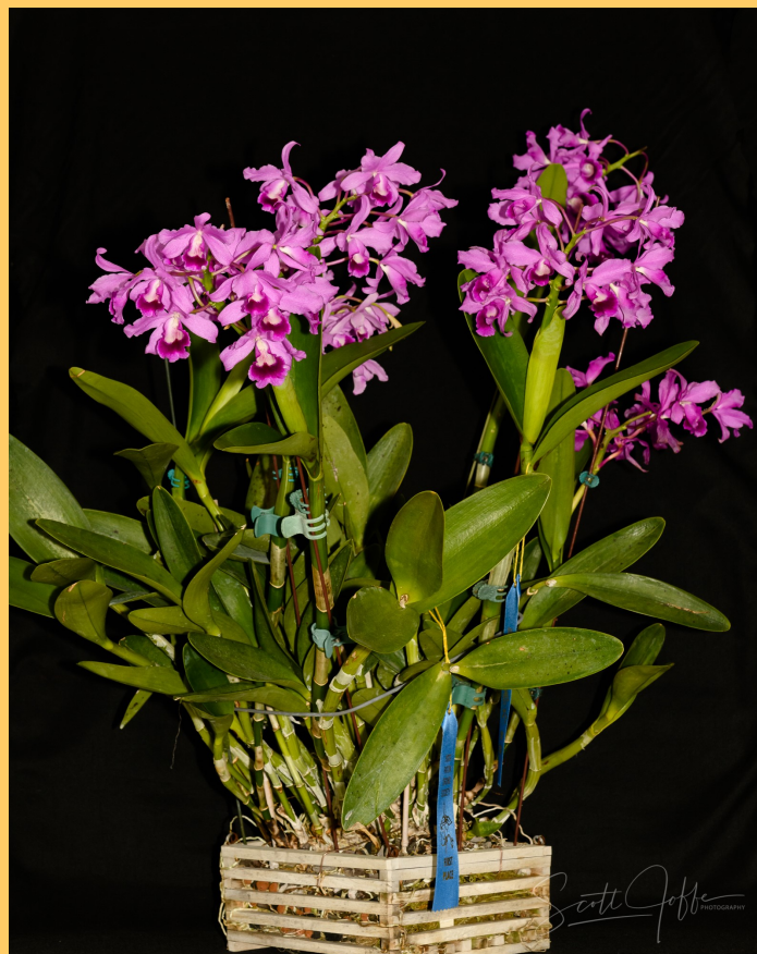
Cattleya bowringiana